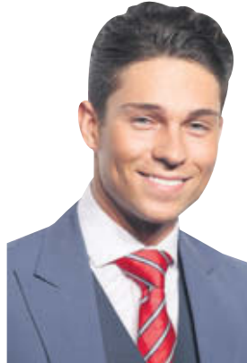
Joey Essex: helped popularise demand

The deans of the four UK dental faculties recently wrote to Lord Howe, the health minister with responsibility for quality, offering to contribute to any new reviews on developing standards and regulations for "cosmetic" dentistry.