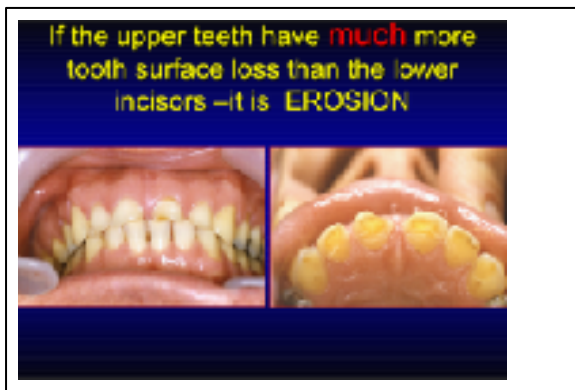
Figure 1 The tooth surface loss is greater at the upper teeth so that they appear shorter and wider

This contrast in the opposing dental arches clearly pointed to chemical erosion as being the most likely explanation for this particular case presentation, because, if the tooth surface loss had been due to physical attrition, then the much smaller lower incisors would have been worn preferentially, or at the very least equivalently, to match the tooth surface loss apparent at the upper incisors. By way of illustration of this important differential diagnostic point, two images from a DIFFERENT case, this time actually showing SEVERE preferential tooth surface loss are shown below.